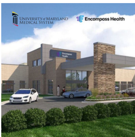
UMMS & Encompass Health

Encompass Health and University of Maryland Medical System announce joint venture to own and operate rehabilitation hospital in Bowie