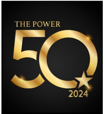
The Power 50

Children's National Hospital Names SVP of Heart Center