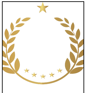
Top 100 Hospitals

MedStar Health Taps New Lead of Government Affairs