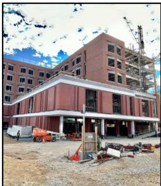
Cedar Hill Regional

Cedar Hill Regional Medical Center GW Health Opening in Early 2025