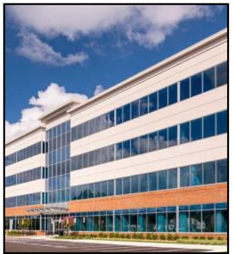
MedStar Medical Group

Valley Health's Acute Care Hospitals Consistently Recognized for Top Tier Patient Safety